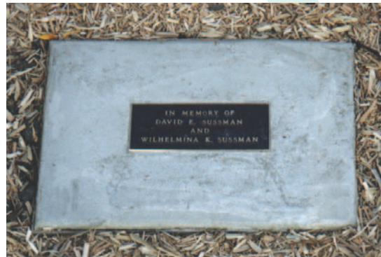
Cast-bronze tree plaque (3 1/4" x 8" actual size) mounted in concrete.