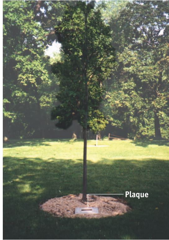
Tree donation with plaque.