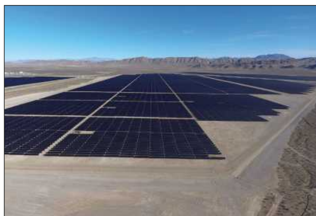
Solar arrays line the desert floor of the Dry Lake Solar Energy Zone as part of the 179 megawatt Switch Station 1 and Switch Station 2 Solar Projects north of Las Vegas in this file photo.

and natural gas lease sales in the Gulf of Mexico and numerous western states, after a federal judge sided with Republican-led states that sued when Biden suspended the sales. During a Tuesday conference call with reporters, Interior Secretary Deb