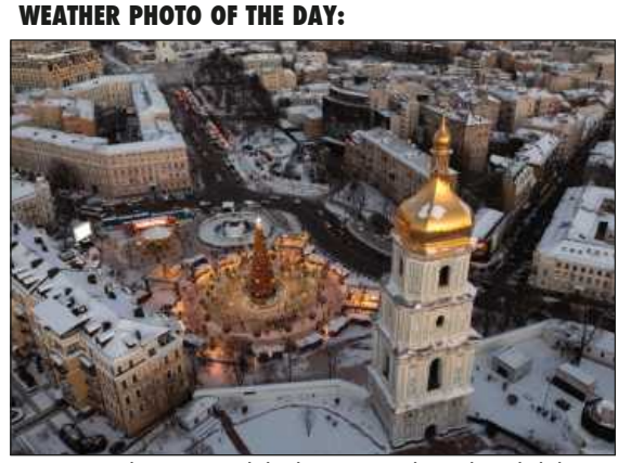
WEATHER PHOTO OF THE DAY: Snow covers the city center with the Christmas tree and St. Sophia Cathedral in view Tuesday in Kyiv, Ukraine. GOT A WEATHER PHOTO? SUBMIT IT AS OUR PHOTO OF THE DAY. INCLUDE NAME, HOMETOWN AND PHOTO LOCATION. SEND THE 3-INCH-WIDE BY 2-INCH-DEEP, 200 RESOLUTION,.JPG PHOTO TO ENIDNEWS@ENIDNEWS.COM.