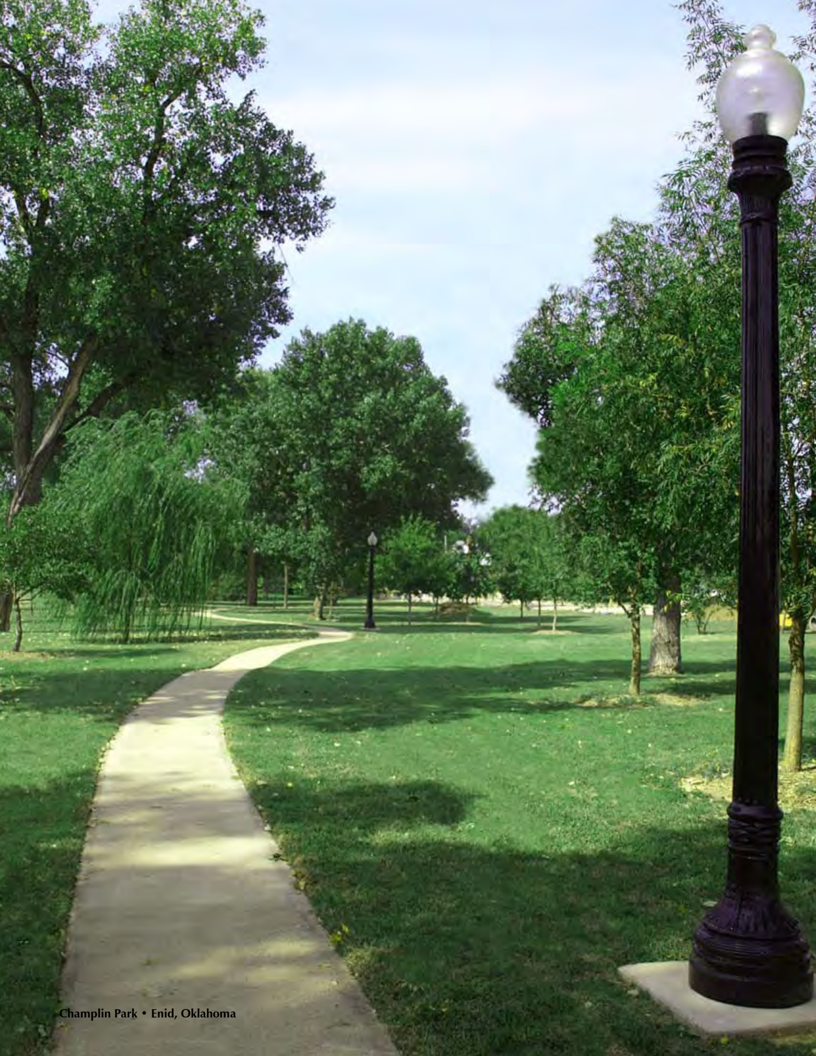
Champlin Park • Enid, Oklahoma